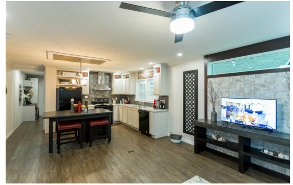
Inspiration Series single wide HUD home 186533