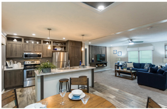
Inspiration Series sectional HUD home 186029