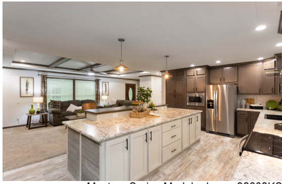
Masters Series Modular home 92608KS

Together, Cavco and Fairmont Homes share a similar business philosophy of manufacturing superior, energy efficient homes for the modern day home buyer — an added advantage of quality, value, and innovation.